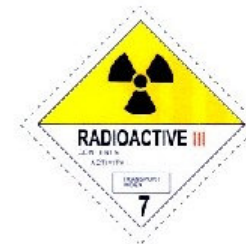
Figure 7 in bottom corner.

Two red vertical bars should follow the word RADIOACTIVE .