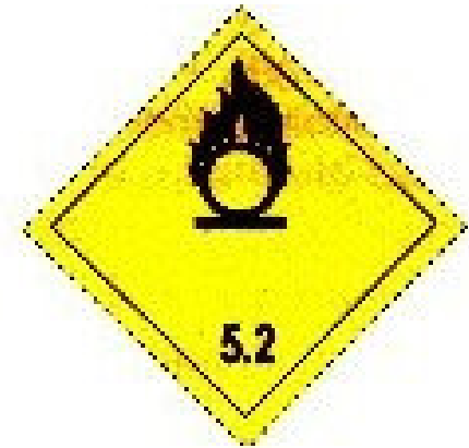
(No. 5.2) Class 5.2 Organic peroxides

Symbol (flame over circle): black. Background: yellow.