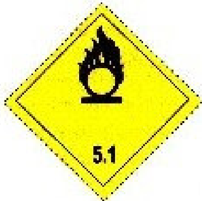
(No. 5.1) Class 5.1 Oxidizing substances