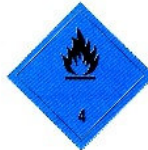
(No. 4.3) Class 4.3

Symbol (flame): black. Background: upper half white, lower half red. Figure 4 in bottom corner.