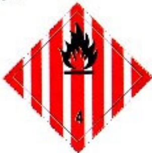
(No. 4.1) Class 4.1