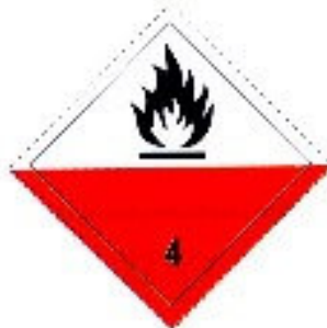
(No. 4.2) Class 4.2

Symbol (flame): black. Background: white with seven vertical red stripes. Figure 4 in bottom corner.